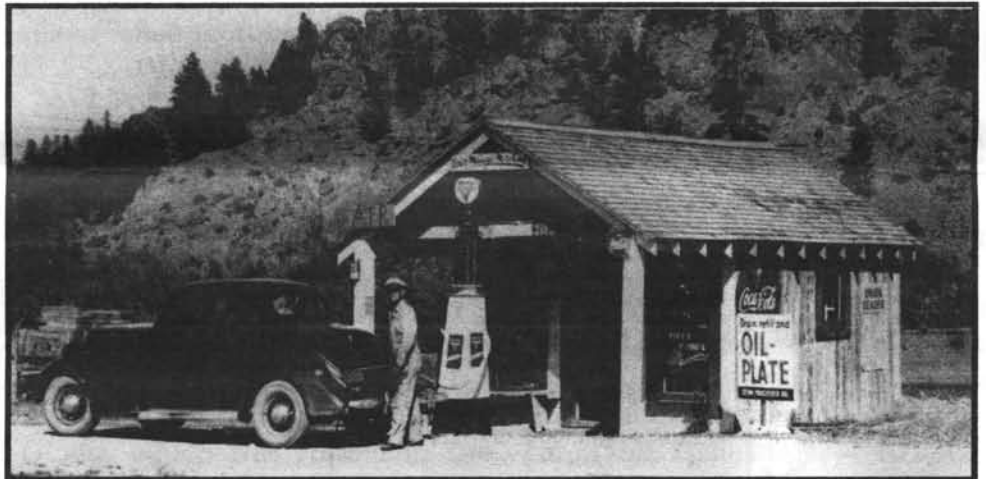
1939 Plymouth near Kingman, Arizona

the advertised commodities in that little building, or there would not have been any room for the Plymouth driver to squeeze into find something to buy. But check that list of stuff again. It's practically everything you find in a modern convenience store attached to a gas station today! This place was small and modest as one would ever find yet it had all the services and supplies that motorists on busy, Route 66 needed in 1939. My, how times do change.