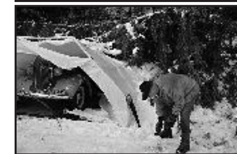
Just to show you that '38 Plymouths really are built tough, ouch!!!