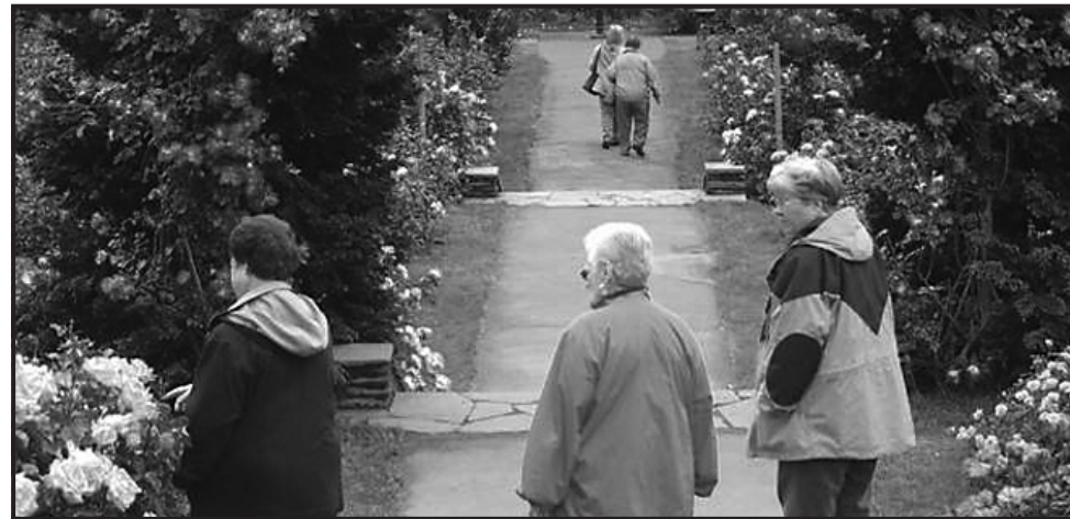
CPCC Members enjoy sites at Portland Japanese Garden