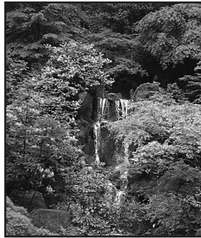
Nice waterfall at Japanese Garden

Be sure to mark these events on your calendar. If you're not at the preceding club meeting to sign up, be sure to call Lorraine Griffey at 503-666-2222 to be included.