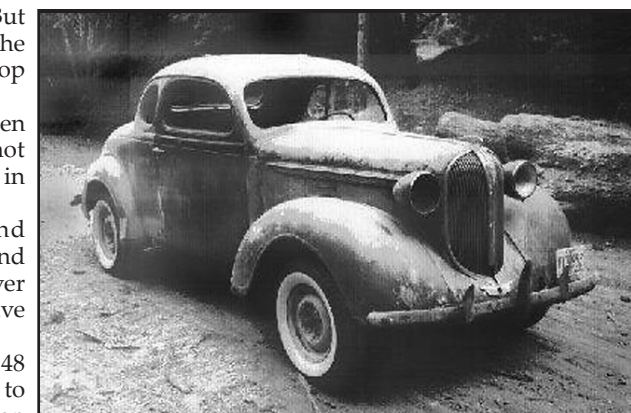
The Freeman's 1938 Plymouth Business Coupe started out needing lots of TLC, what a difference after 7 years.

He was living in a trailer park and rules expressly prohibited working on a car in the park. He had only a carport and no garage. So he had to put all the parts together so it