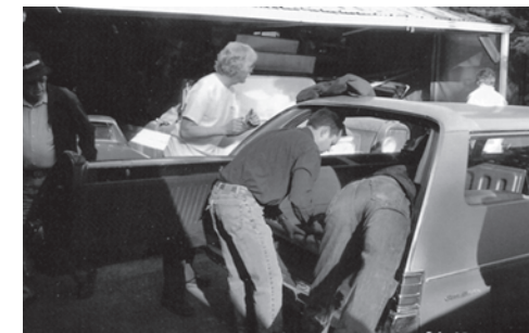
How many CPPC members does it take to install a spare wheel well? The job certainly doesn't look easy. The Tech Committee had its own name for the "surgical procedure."