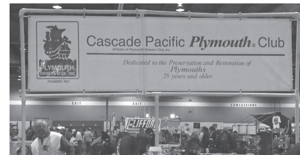
The CPPC banner stood high above the crowd, helping to draw car lovers in from the rainy outdoor exhibits to our large display of merchandise.