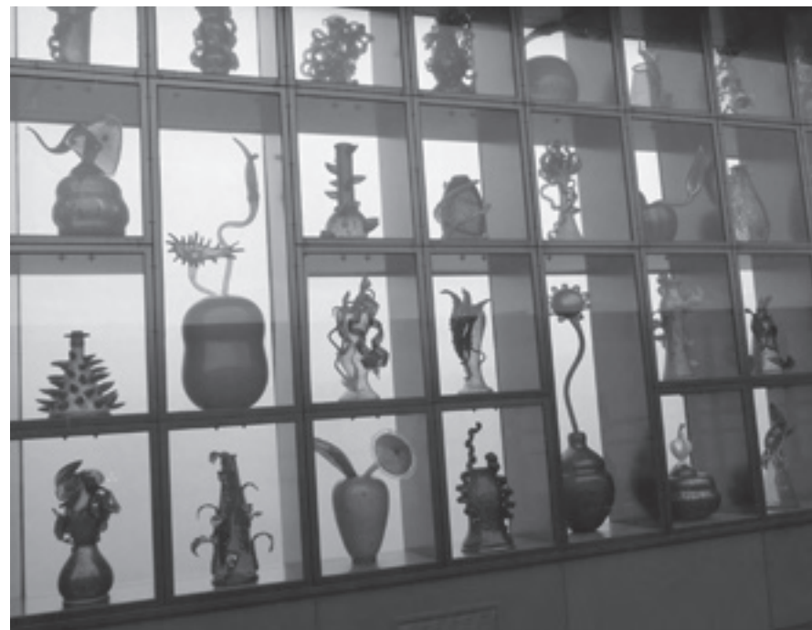
The Venetian Wall staggers the imagination with brilliant hues and whimsical shapes.