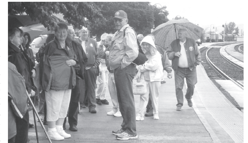
Most of the crowd boarded at the Vancouver Amtrak station, waiting for the #509 to come across the river and 'round the bend.

It was a generally soggy group that met up at the Amtrak station for the ride home. The vote was unanimous – it was a great day and we were glad we didn't have to drive home! See more photos on page 5