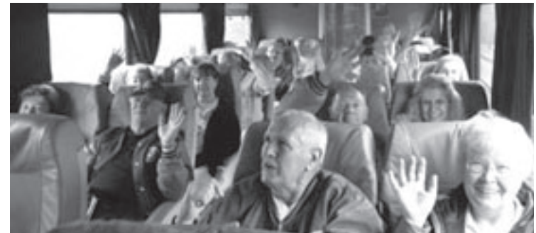
Our own rail car was filled with 36 energetic people on the route north. The crowd was a bit quiet on the southbound leg. Photos of the sleepers were excluded to protect the droolers.