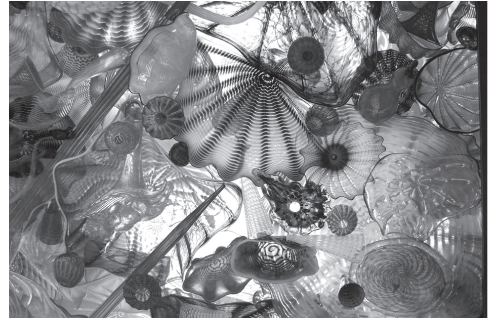
Gazing upward at one of the panels in the suspended ceiling exhibit in the Sea Pavilion are shells, sea urchins, jellyfish and other sea life created in glass.