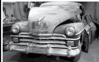
1950 Chrysler Highlander Windsor FOR SALE

2 Dr Spitfire. 6 Cylinder. 99k miles. Fluid Drive. 4-sp transmission. Straight, Complete Body. Recent Engine Rebuild. Needs Interior. $2000/ OBO. Call Don. 503.799.5438