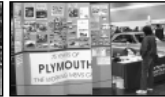
Plymouth Club Display