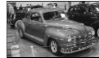
The Williams's '47 P-15 Coupe