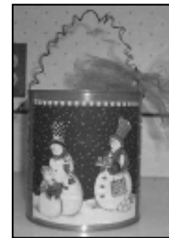
Christmas Can Sample