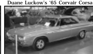
The Cerruti's '64 Sport Fury