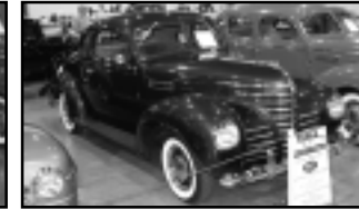
The Farnsworth's '39 Business Coupe