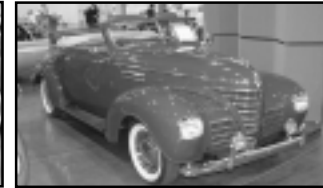
The Call's '39 Convertible