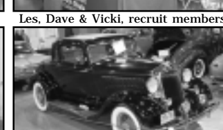
The Bade's '33 Business Coupe