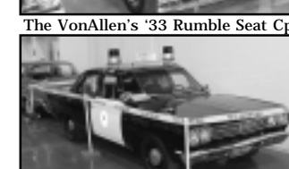
The Houck's '69 Police Cruiser