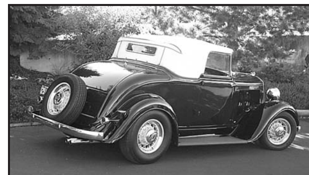
The Hunley's 1933 Plymouth PC Convertible

Plymouth is a registered trademark of Chrysler Motors and is used by special Permission