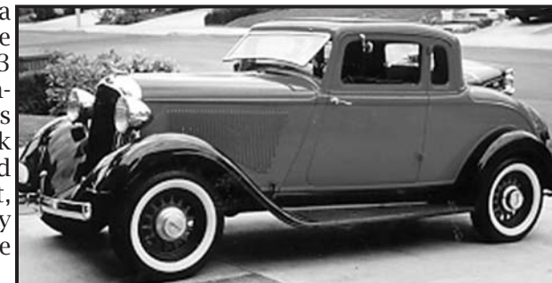
The Hunley's 1933 Plymouth PD Coupe

The '33 was the "Runt-of-the-Litter" in a collection of 30's Chrysler Products in the gentleman's collection. The '33 had been restored in the late 60's and had a winning pedigree, a "Show Winner" in several 1970's Antique Auto Club of America shows, in the New England area.