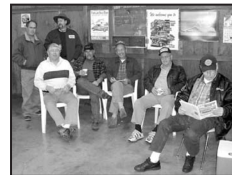
Members of Tech Committee taking a break from activities.