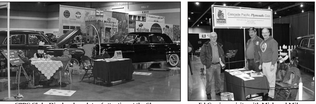
CPPC Clubs Display drew lots of attention at the Show