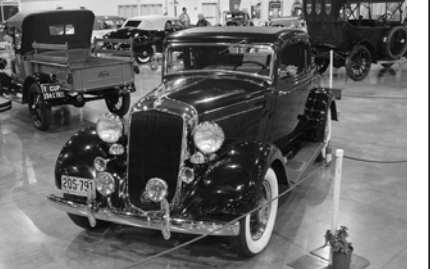
TheBade's 33 Plymouth Coupe