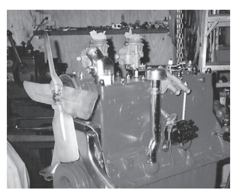
Evidence of Don's craftsmanship.

The first thing that has to happen is for you to have your reflectors nickel plated. This involves polishing the