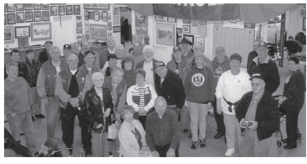
Thirty-four CPPC members spent a sunny Sunday afternoon immersed in automotive history. There was something to appeal to everyone.

Plymouth is a registered trademark of Chrysler Motors and is used by special permission.