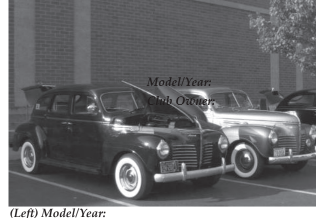
Club Owner: (Right) Model/Year: Club Owner: