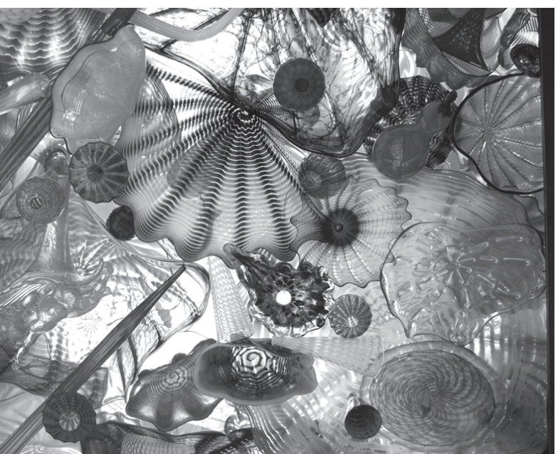
Gazing upward at one of the panels in the suspended ceiling exhibit in the Sea Pavilion are shells, sea urchins, jellyfish and other sea life created in glass.