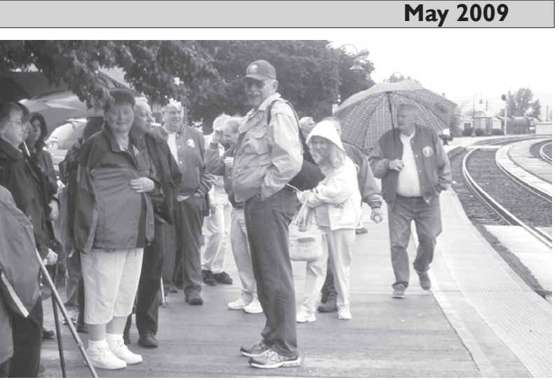
Most of the crowd boarded at the Vancouver Amtrak station, waiting for the #509 to come across the river and 'round the bend.

Belvedere, Cabana, Cambridge, Caravelle, Cranbrook, Deluxe, Duster, Fury, Horizon, KCar, Laser, Neon, Plaza, Plymouth, Prowler, Reliant, RoadRunner, Sapporo, Satellite, Savoy, Scamp