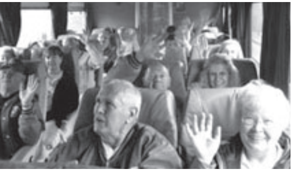
Our own rail car was filled with 36 energetic people on the route north. The crowd was a bit quiet on the southbound leg. Photos of the sleepers were excluded to protect the droolers.