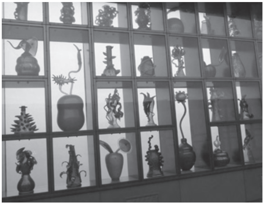
The Venetian Wall staggers the imagination with brilliant hues and whimsical shapes