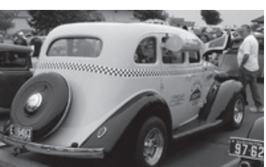
Plumouth Taxi Cab

Cascade Pacific Plymouth Club, Inc. October 2009