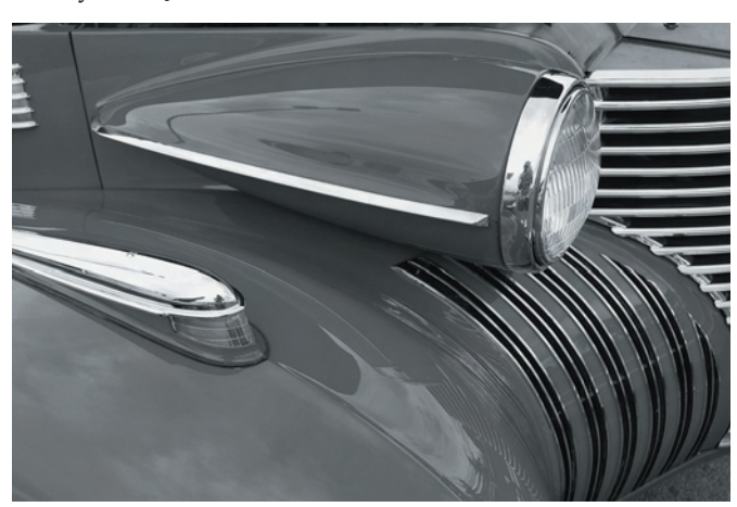
Headlight - Side