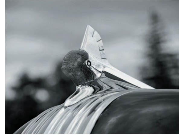
Pontiac Hood Ornament