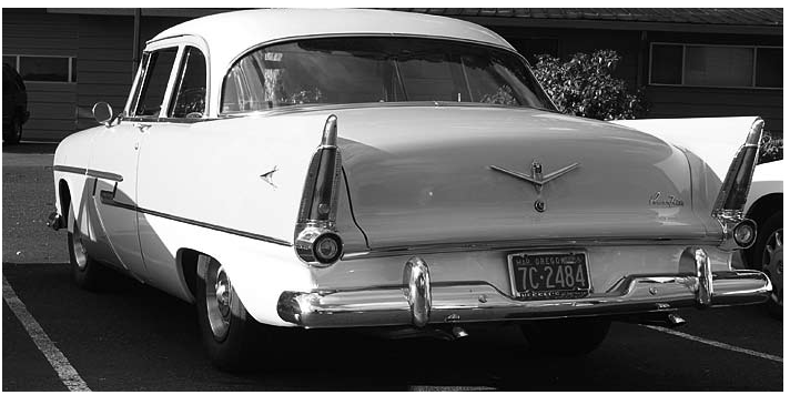
FINS! Tom and Vickie Shepherd drove one of their 1956 Plymouths to the Hot Dog Fest.

We can arrive at 10:00 AM for coffee hour and a three course lunch will be served at 11:00. We will have the room until 2:00 PM for additional social time and shopping. The cost for the luncheon is $20. each. There will be a sign up sheet and information about payment at the September meeting.