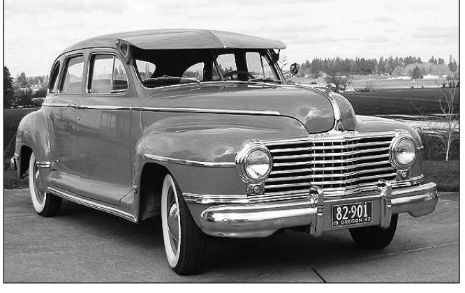
The 1942 Dodge Custom D-22 looks good in Mopar's signachased my 1940 Plym- ture light blue. As soon as a driveline vibration is sorted out, Tim will be driving it to club meetings.

Read the whole story on CascadePacificPlymouth.org.