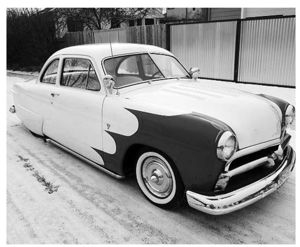
Old-Car Fever struck again at Tim McCarthy's house, and although the result is a Brand-X car, it is partly redeemed by creative use of a grille from a 1955 Plymouth. Here's Tim's account: "My newest old car comes from Fort Collins, CO. I traded my '59 Edsel Villager wagon plus some cash for this vintage hot rod. She is a '51 Ford club coupe. The motor is a built up 351 Cleveland, with a standard floor shift toploader 4 speed. The car has been changed to 12 volt. She has period style white tuck n roll interior, frenched '50 Ford tail lights, hot rod bubble extreme fender skirts, a louvered hood, functioning laker pipes, cool pinstriping, and the best part: a 1955 Plymouth grill! So, she does she qualify for a Mopar, or better yet, a Plymouth?"