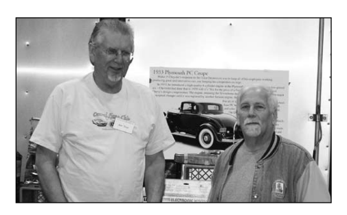
Plymouth is a registered trademark of Chrysler Motors and is used by special permission.