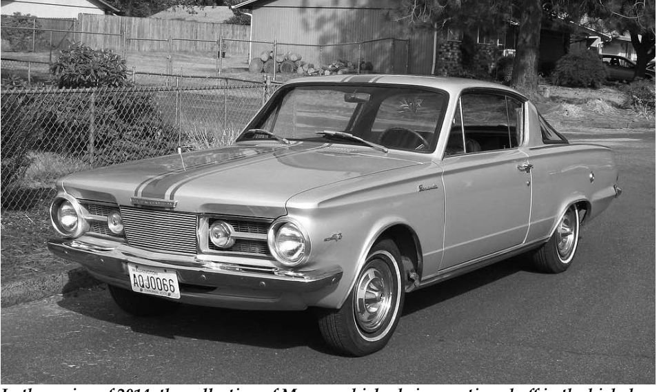
In the spring of 2014, the collection of Mopar vehicles being auctioned off in the high desert town of Brothers, Oregon, was getting worldwide attention. Container-loads of cars and parts, it was reported, were shipped off to Europe. But not this one: this Barracuda went home to Vancouver, WA, with CPPC member Bruce Kerslake.

The interior was black vinyl with tears in the bucket seats and a sagging headliner separated at the seams. The dash was pretty nice, back seat and door panels decent and all the engine dress up items intact and nice. The odometer showed 91,000 miles. The bias ply tires were aged cracked and the left front flat. The next week end I got a friend with a one-ton truck and trailer to take me down to Brothers to pick up the car. We arrived at the collection to find it was 34 degrees and blowing snow. We replaced the flat tire, loaded the car, and unloaded into my carport 4 hours later.