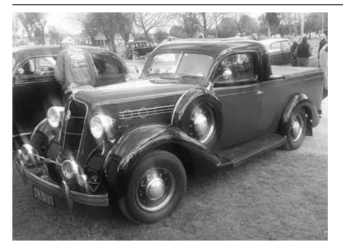
OUT & ABOUT: (Above and Right) Australia had Utes in 1935. Nice ones, too. We wonder what marketing genius decided they would never sell in the USA and made us wait for the 1957 Brand-X Ranchero.